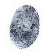
Make your Fingerprints