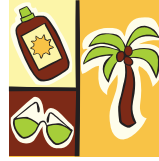
Make a collage