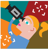
Video record yourself