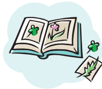
Make a scrapbook