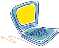
Start a YouTube channel