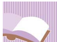
Self-publish a book